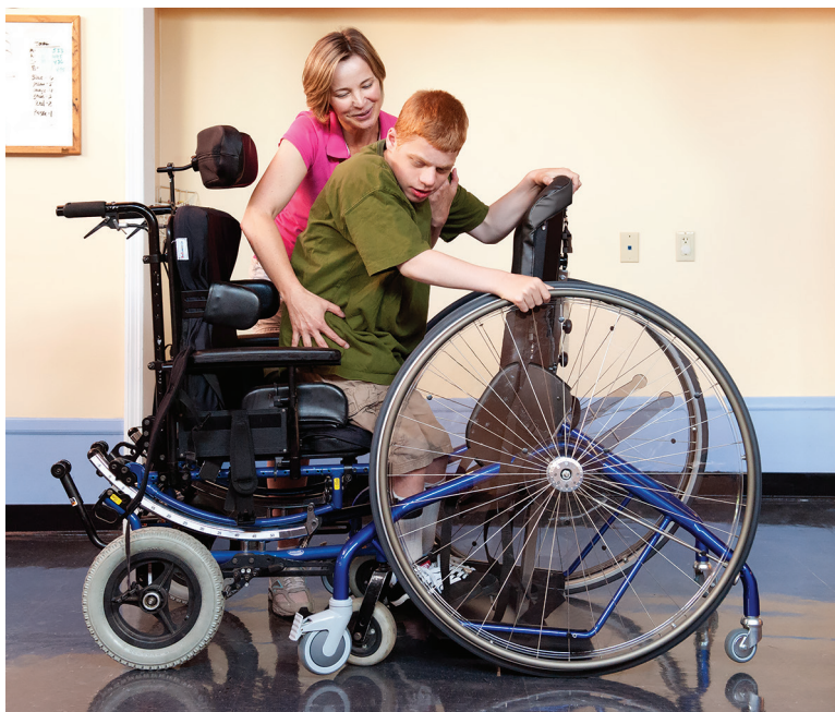
The wide, accessible deck makes transfers easy.