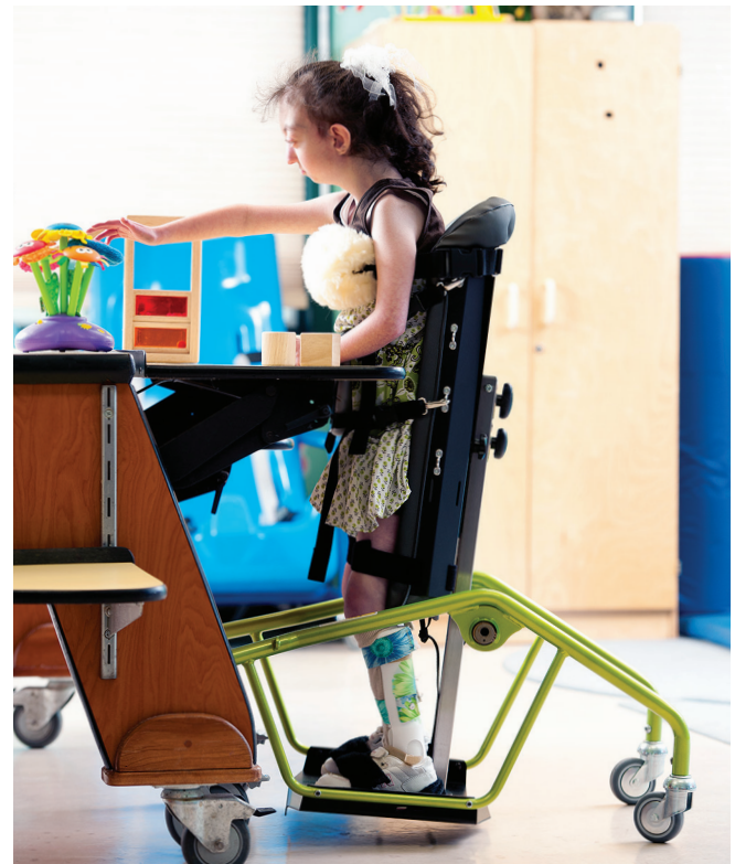
When Carolyn can actively extend her hips and knees to bear her own weight, she is placed in the reverse position. This allows free arm movement as her standing ability develops.